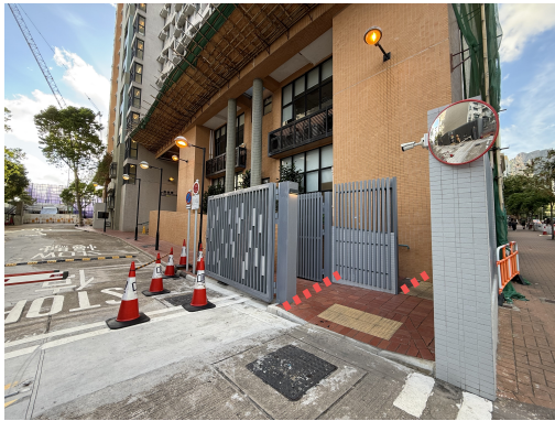
Temporary closure of Entrance Gate