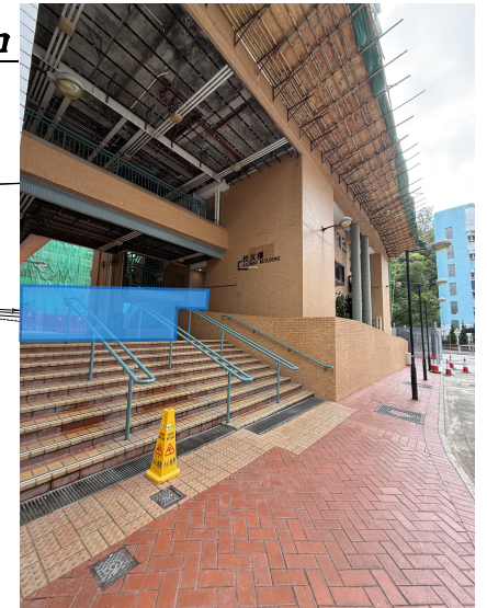
Temporary closure of Passageway by Water Barriers